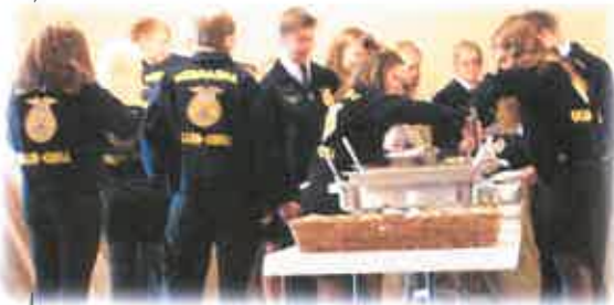
FFA Banquet celebrating a great year on April 26