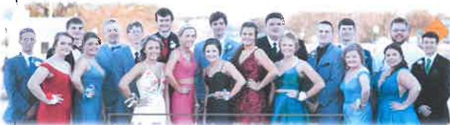
Diller-Odell Seniors celebrating Prom on March 16

School is coming to a close and our youth and confirmation students have been busy. We have VERY talented young people in our congregation!