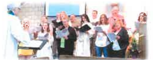
A big Thank You to those in the Choir who sang at both services on Easter