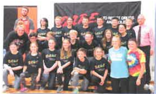
Diller-Odell Sixth Graders graduated from D.A.R.E. on April 24