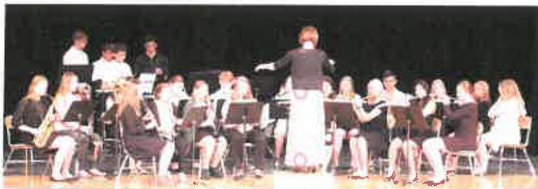
The high school band performing at the District Music Contest in Fairbury on April 20