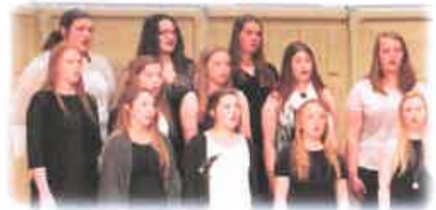
Church members in the High School Chorus performing at the District Music Contest on April 20