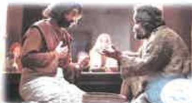
This banner (right) was displayed in our church on Maundy-Thursday