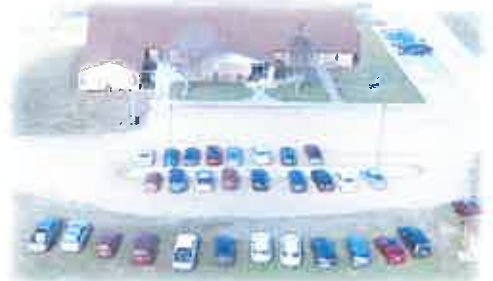
Aerial Photo courtesy of Corinna Lothman

After worship, we all participated in a Palm parade throughout town and down Main street, waving our Palms and celebrating the arrival of Jesus.