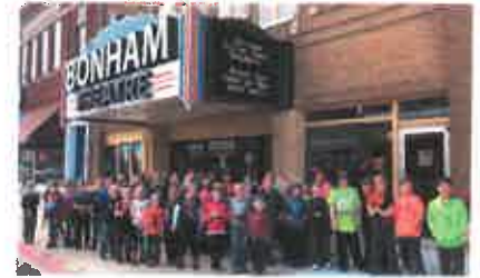
Diller-Odell elementary enjoyed a movie at the Bonham Theater in Fairbury as a reward for reading. Even congratulated on the marquee!!

131 Diller-Odell Elementary students were spotted Reading Across Nebraska during the month of March. These students were challenged to read books at or above their reading level and pass Accelerated Reader quizzes to complete the 450-mile journey across Nebraska. This goal was exceeded with 727 books read and quizzes taken plus another 160 plus books read to the kindergarten students for a total of 887 books read.