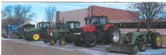
The Parade of Tractors – It was "Drive your tractor to school day" on Feb 21 as part of FFA Week. Always a fun sight.

As a reward for reaching this goal plus the individual goals each student had set for them we traveled to the Bonham Theatre in Fairbury on March 28 to watch the movie, Ferdinand . Everyone got a bag of popcorn, some candy, and a pop of their choice. It was a very fun afternoon! Great job of reading, Griffins!