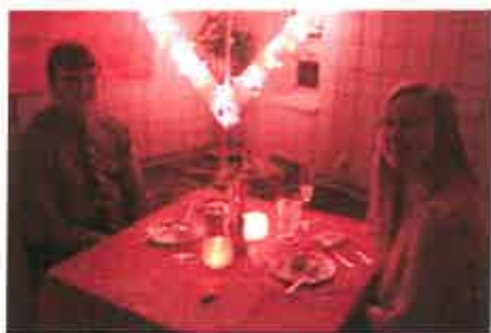
Again, our Youth held a wonderful event for our church.