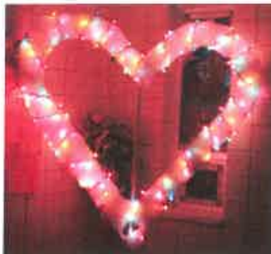
Beautiful decorations, delicious food and lovely company made a memorable evening.