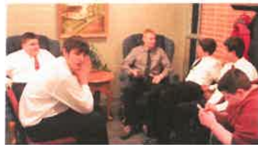
Thank you, our Youth, for always making this event so special.