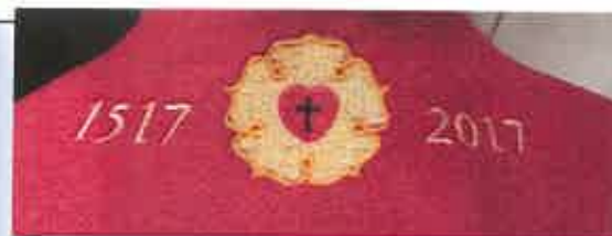
A special stole was purchased for the Milestone Anniversary