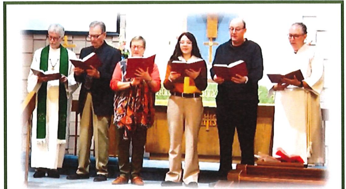
It was wonderful to hear our choir sing during worship on February 11 th . Special music will be shared during worship on the second Sunday of the month.

Pictures and information for the board are being accepted until May 21 (if you want your picture and info in the Newscaster ), and the information needed is the name ( First, Middle, Last ) of the graduate, parents' or grandparents' names, name of school, school colors, degree earned and future plans. Please submit wallet-sized pictures or email to kweers10@gmail.com . Thanks!!