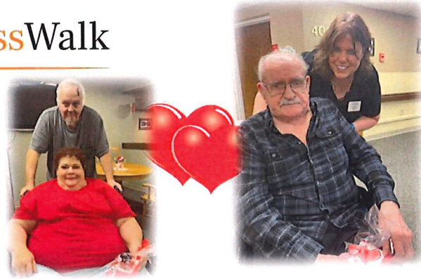
Some of the residents from Heritage Care Center who were very appreciative of the Valentines from the CrossWalk kids